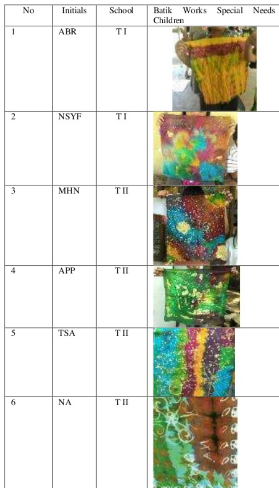
TABLE VII BATIK WORKS OF SPECIAL NEED CHILDREN

Based on Table VI, the result from Spearman's rank correlation analysis, shows that the virtual teachers' pedagogic competence and professional competence do not affect significantly the accomplishment of the special needs children in learning batik. While their personality and social competences significantly affect the special needs children accomplishment in learning batik (see Table VII).